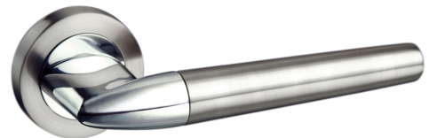
Product Finish Pictured: Satin Nickel / Polished Chrome